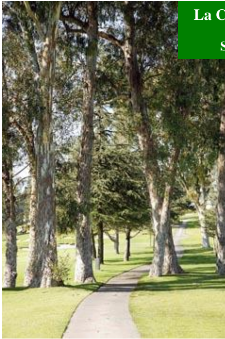
La Cumbre Country Club 4015 Via Laguna Santa Barbara, 93110